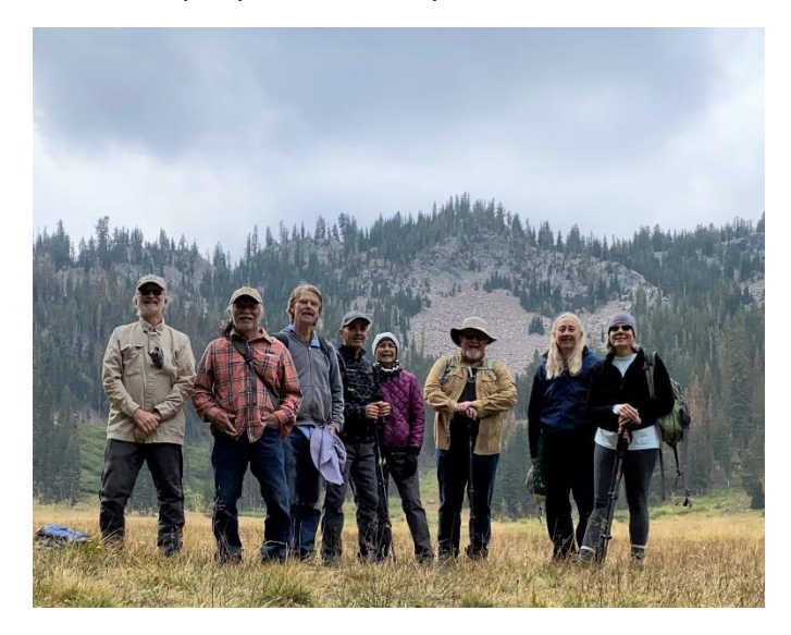
Paradise Meadows.

We had eight people attend this field trip carpooling in three cars to keep down our CO2 emissions with one person needing to drive separate for a family visit to Chico. A summer hike that seemed like mid fall due to the overcast skies and cold temperatures. This trail is over 7000 feet in elevation, and we were the first people on the trail, so we had it to ourselves although we did run into a few people on the way back.