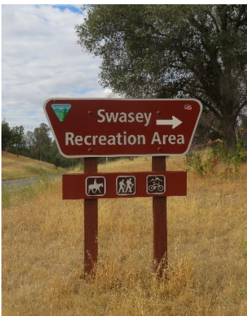
BLM Recreation sign