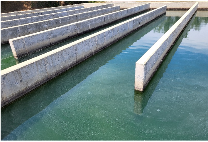
Treated water ready for filtration and chlorination steps.