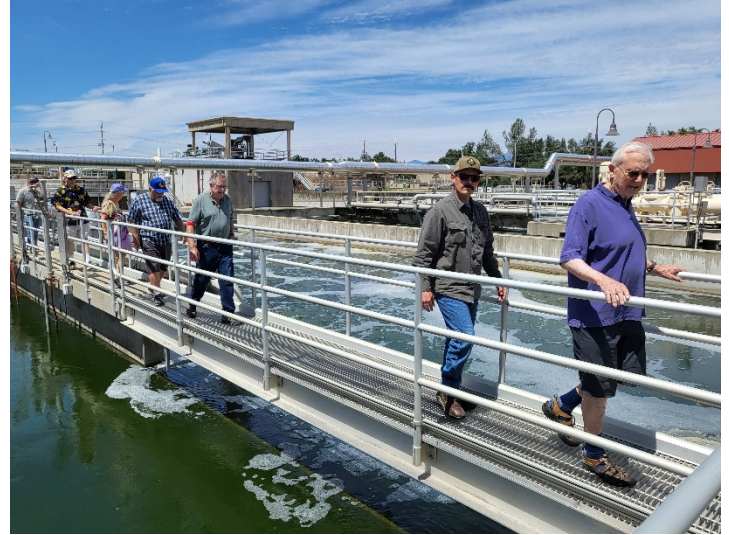
Walkway across treatment plant

From here we went to the various treatment areas where sewage is broken down using the two types of bacteria. Anaerobic bacteria treats the sewage first with water heated to 98 degrees, then it is sent to an Aerobic Basin where the aerobic bacteria, supplemented with oxygen, breaks down the remaining organic waste which is referred to as Bio-solids. All of the bio-solids are currently being taken to the landfill. In California the deadline to stop sending bio-solids to the landfill is in 2025. The plant is currently in the process of getting a pyrolysis unit online that will break down and heat the solids to 98% dry and hauled off by a third party.