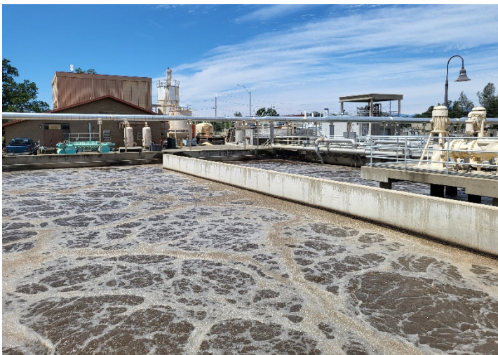
Early input for aerobic bacteria

At the start of a tour, Tim showed us a short video, and an overview of the operation and answered a lot of questions! Then we started the walking tour with the first processing of sewage as it enters the plant. Here the sewage is cleaned of various things people throw down the toilet, especially the baby wipes which have to be taken out. Baby wipes are the worst culprit in the operations as they cannot be decomposed and can clog up sewage pipes. During the Covid lockdown and toilet paper shortages, people started using rags which clogged up sewer drain lines in certain neighborhoods.